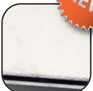
Double-Sided ACP Core