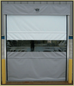
Motorized & Spring Assist Vinyl Roll Up Door

recommended door where wind load or pressure differential exists. See Drawtite Doors for those applications. FOB Shipping Point.