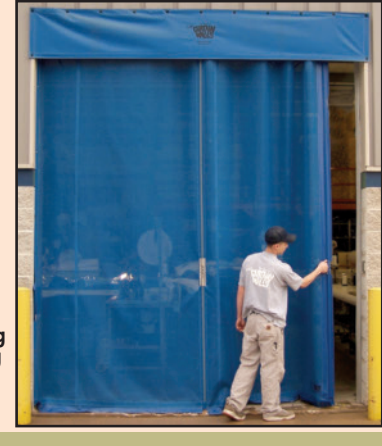
Manual Slide Bug Blocking Curtain Door

Motorized & Spring Assist Bug Blocking Curtain Door