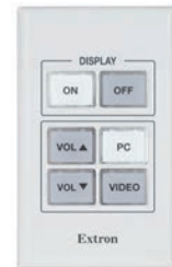
MLC 55 RS