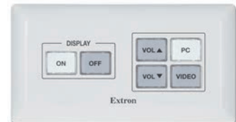
MLC 55 RS EU