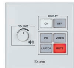
MLC 55 RS VC