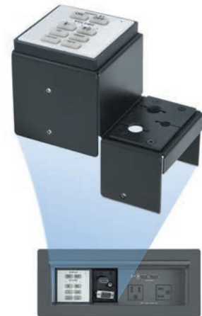
Installed in Cable Cubby 1200