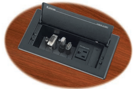
Cable Cubby 202 shown with optional products; sold separately