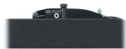
Variable-speed control for cable retraction