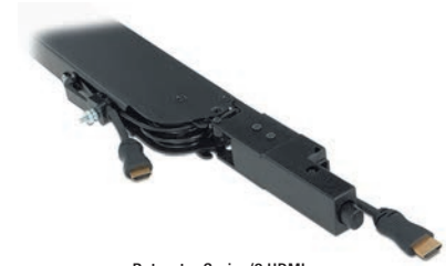
Retractor Series/2 HDMI