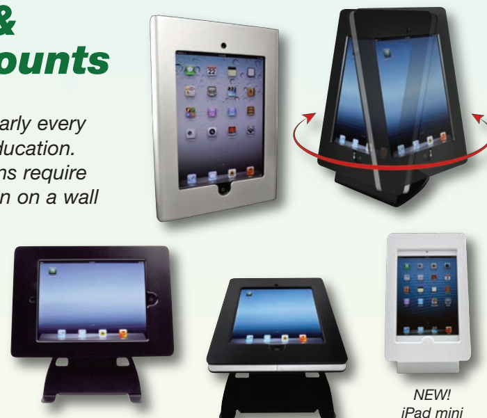
NEW! iPad mini

The Orchard Series of desktop and wall mounts for the iPad 2, New iPad and iPad Mini are available in many styles, colors and mounting options.