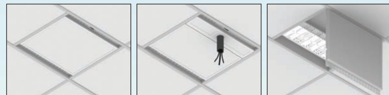
CB-22 closed CB-22 closed with pole CB-22 open