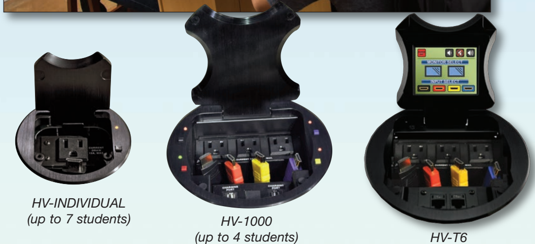
HV-INDIVIDUAL (up to 7 students)