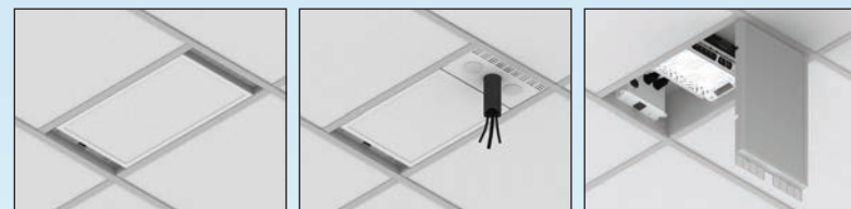
CB-12 closed CB-12 closed with pole CB-12 open

Ceiling Boxes are available with an optional pole mount adapter for projectors or other displays.