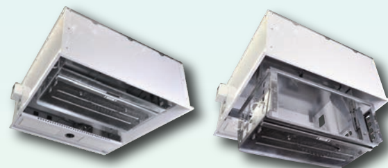
CB-224 closed CB-224 open