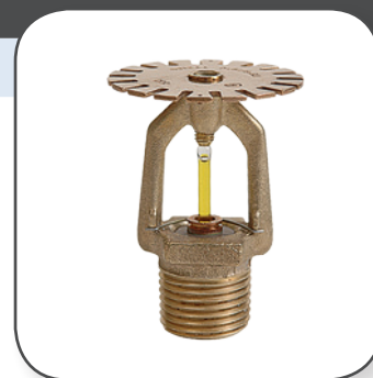
Sprinkler Wrench W-TYPE 6