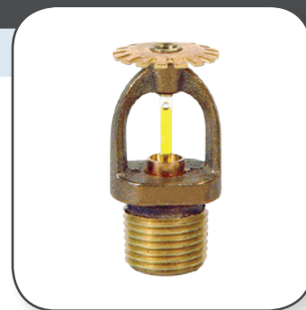
Sprinkler Wrench W-TYPE 20