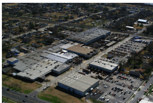
Aerial view of Pellerin Milnor Corporation

The last day of the seminar will cover Troubleshooting practices and techniques including an understanding of inverters. We will discuss Preventative Maintenance requirements of Milnor machines and how to determine what they are. We will stress safety while working with industrial Milnor washer-extractors. We will focus on installation techniques of machinery, and common mistakes made during installation. We will conclude with another in depth look at Milnor Schematics and wiring diagrams followed by a troubleshooting work site where the attendee will be asked to work with the schematics to troubleshoot some various problems.