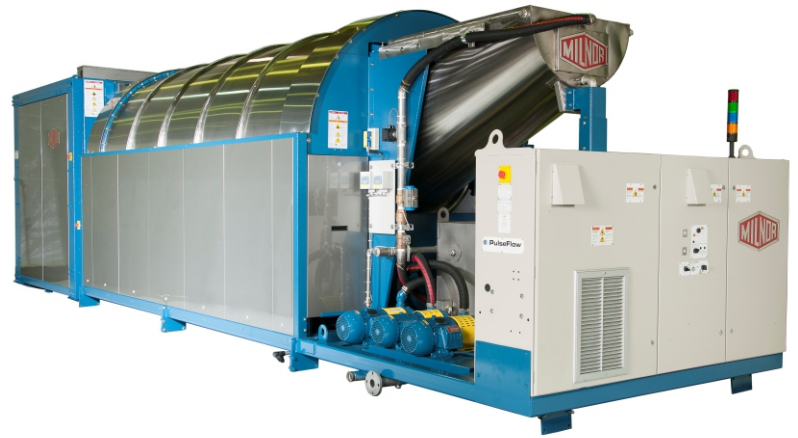
76028 PBW™ tunnel and MXS4232 centrifugal extractor

CBW ® Seminar #1 March 16 - 20, 2015 (Latest PC Based Controls) CBW Mentor, MultiTrac System Controller, Drynet - Dryer Shuttle Controller