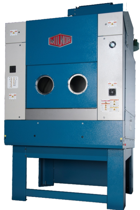
6464 Pass-Through Dryer