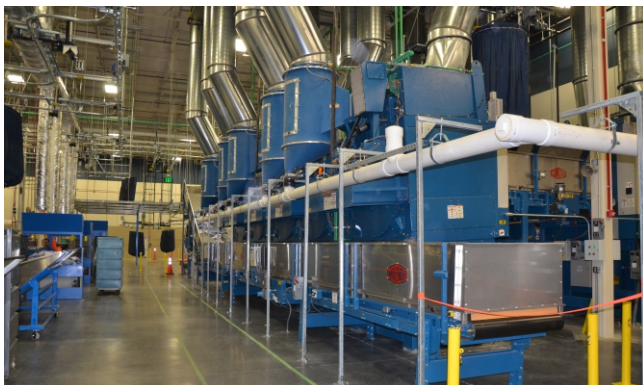
6464 Pass-Through Dryer Pod with Multitrac System Controller Drynet--Dryer/Shuttle Controller

PBW/CBW Washing Principles Extraction Systems Shuttle Devices How to read MILNOR Schematics Overview of Mechanical Devices in CBW Systems