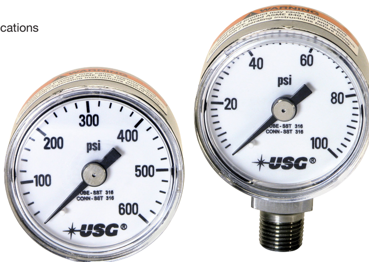
Model P1521 Center Back Mount (CBM) and Lower Mount (LM)