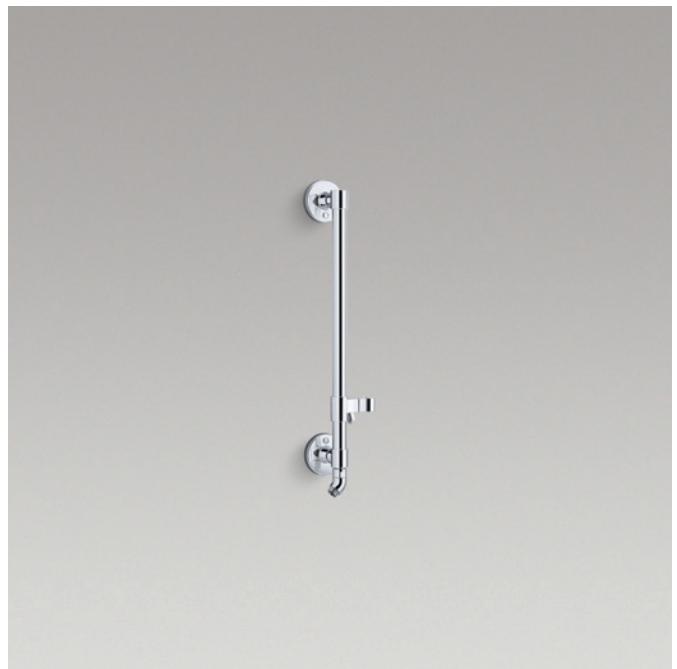
HydroRail-H shower column K-45904-CP