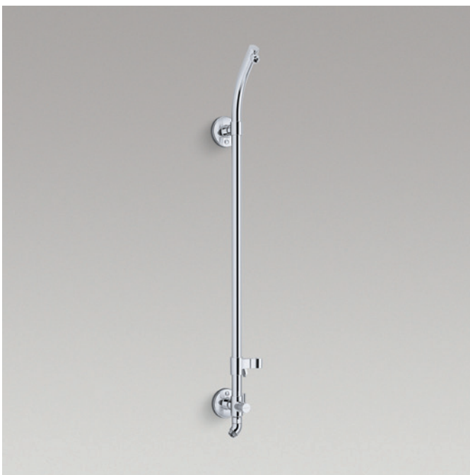
HydroRail-S bath/shower column K-45905-CP

Showerhead, handshower and hose are sold separately.