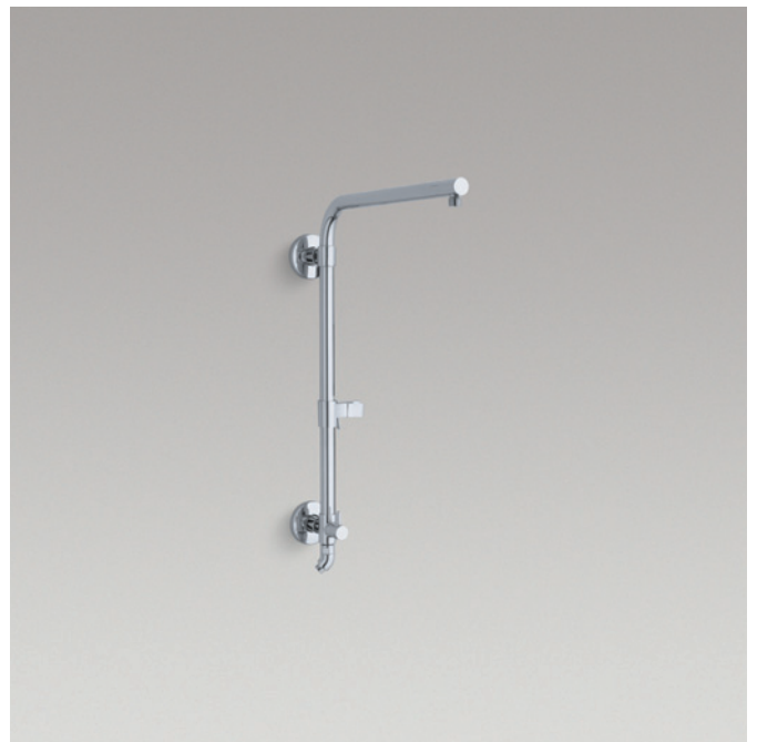
HydroRail-R Beam shower column K-45212-CP

Visit KOHLER.com/Showers to view our full line of showerheads, handshowers and rainheads. See the signature shower sprays of KOHLER at KOHLER.com/SignatureSprays .