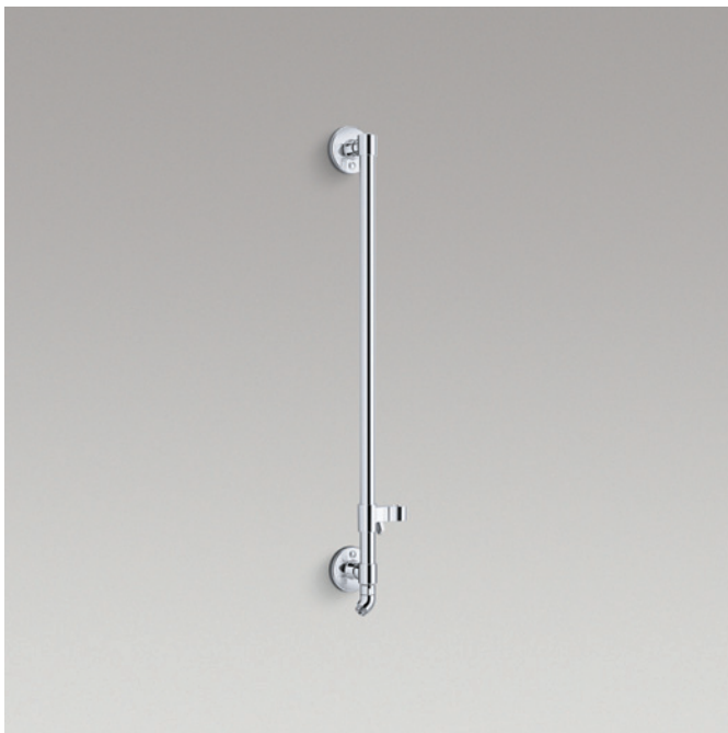
HydroRail-H bath/shower column K-45903-CP

Handshower and hose are sold separately.