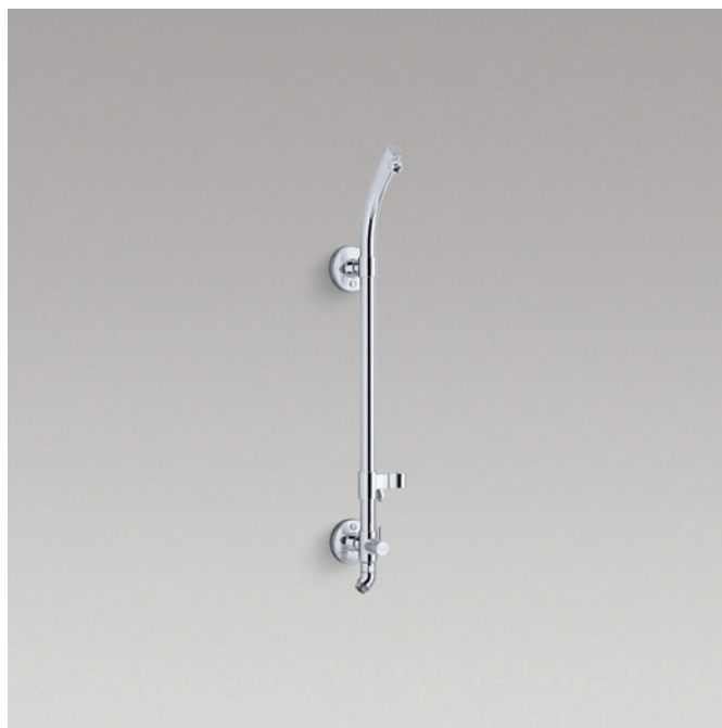
HydroRail-S shower column K-45906-CP

Visit KOHLER.com/Showerheads to view our full line of showerheads, handshowers and rainheads. See the signature shower sprays of KOHLER at KOHLER.com/SignatureSprays .