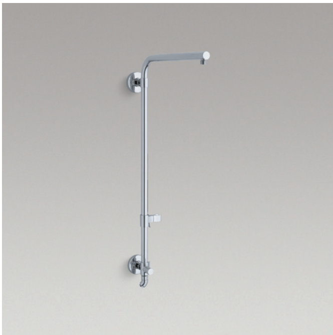
HydroRail-R Beam bath/shower column K-45210-CP

Rainhead, handshower and hose are sold separately.