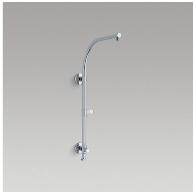
HydroRail-R Arch shower column K-45211-CP