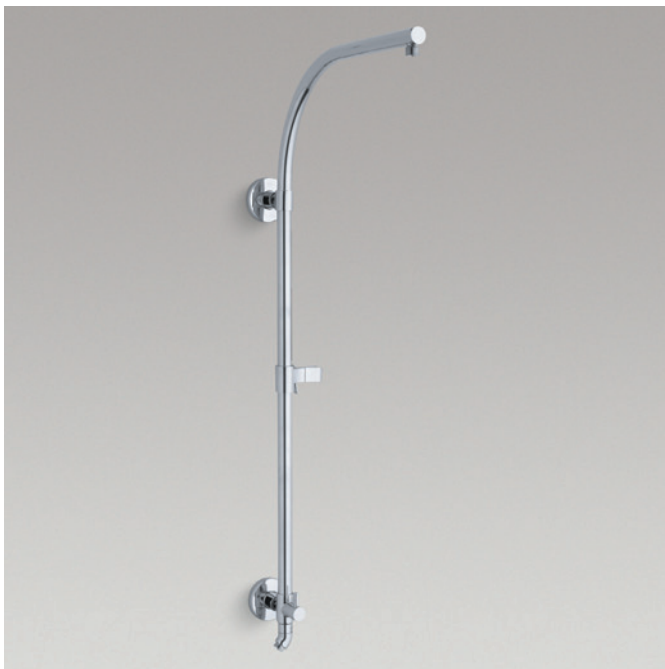
HydroRail-R Arch bath/shower column K-45209-CP

Rainhead, handshower and hose are sold separately.