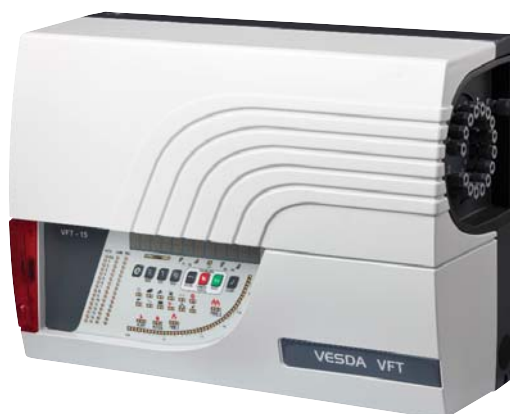
VESDA VFT by Xtralis