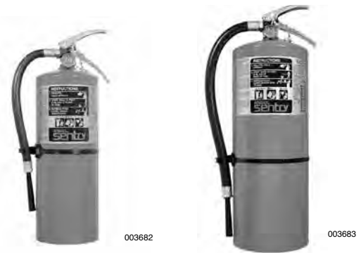
SENTRY 10 LB EXTINGUISHER