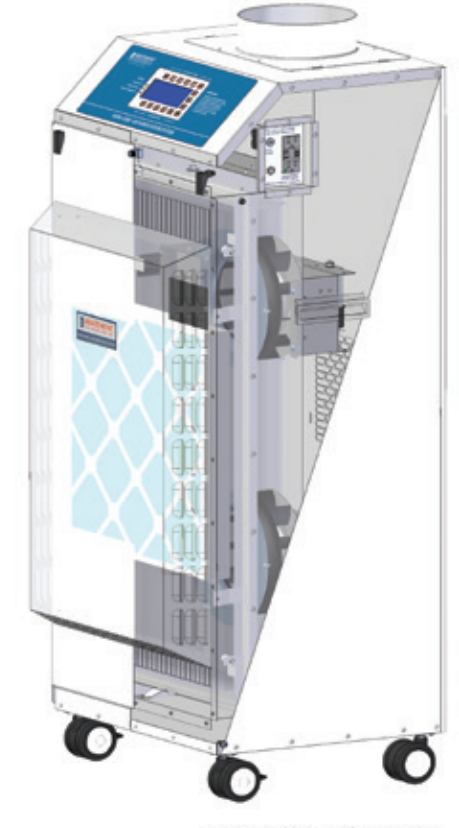
HC800F Portable Air Purification System

HEPA-CARE systems are certified as Class II Medical Devices under FDA 510K, and