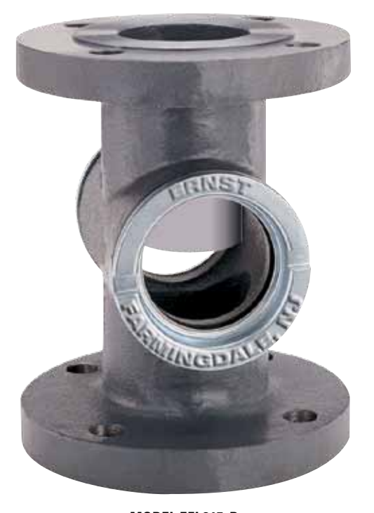
MODEL EFI 215-D (Drip Tube)