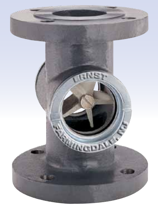
MODEL EFI 215-R (Rynite® Rotating Wheel)