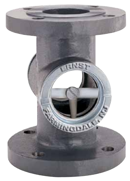
MODEL EFI 215-F (Rynite® Flapper) Not recommended for downward flow