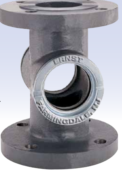
MODEL EFI 215-P (Plain)