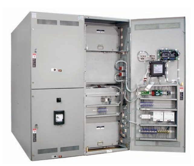
Series 977 Medium Voltage Power Transfer System, two-section enclosure with right door open

The ASCO Series 977 Medium Voltage Automatic Transfer System provides high reliability and ease of maintenance. This model complies with requirements of the: