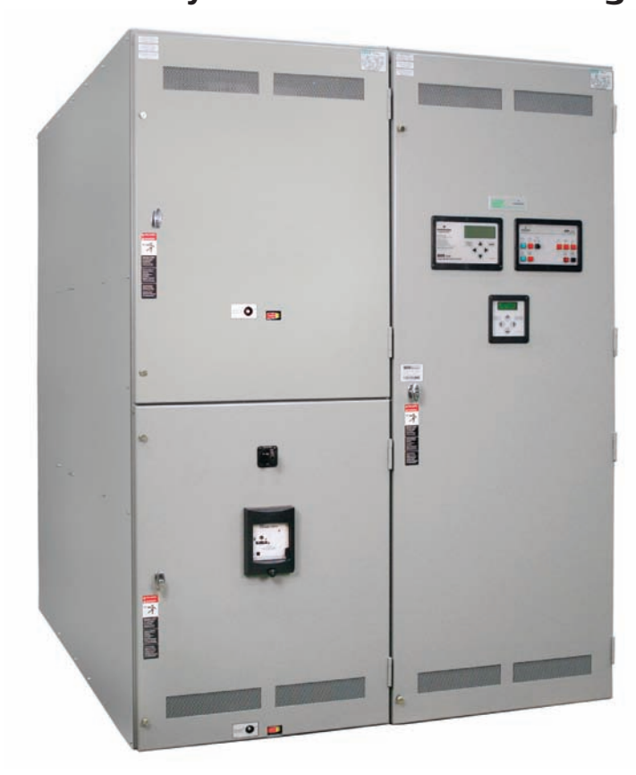
ASCO Series 977 Medium Voltage Power Transfer System

While ASCO Medium Voltage Power Transfer Switches are functionally similar to low voltage transfer switches, they use a pair of medium voltage circuit breakers rather than an ASCO solenoid operating mechanism. An ASCO 7000 Series Power Control Center manages the breaker operation to transfer critical loads between power sources.