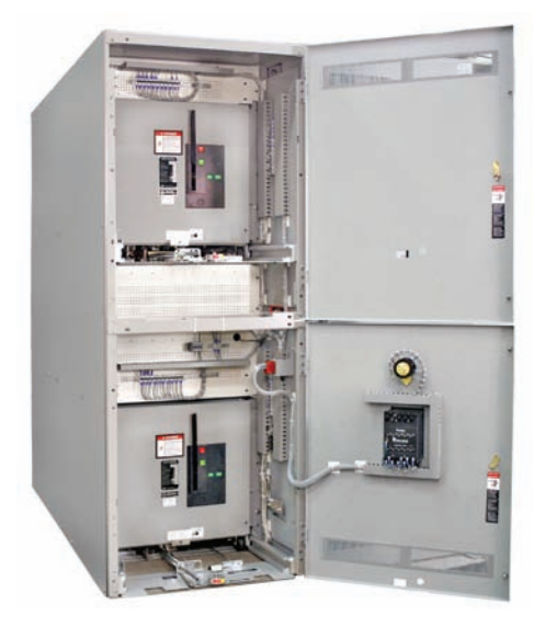
Series 977 Medium Voltage Power Transfer System, single section