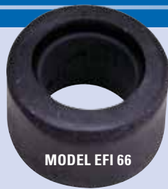
MODEL EFI 66