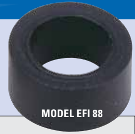
MODEL EFI 88

For Steam, Water Service and other applications