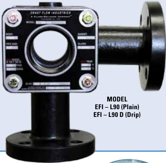
MODEL EFI - L90 (Plain) EFI - L90 D (Drip)