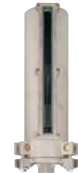
MODEL EFI GL-530