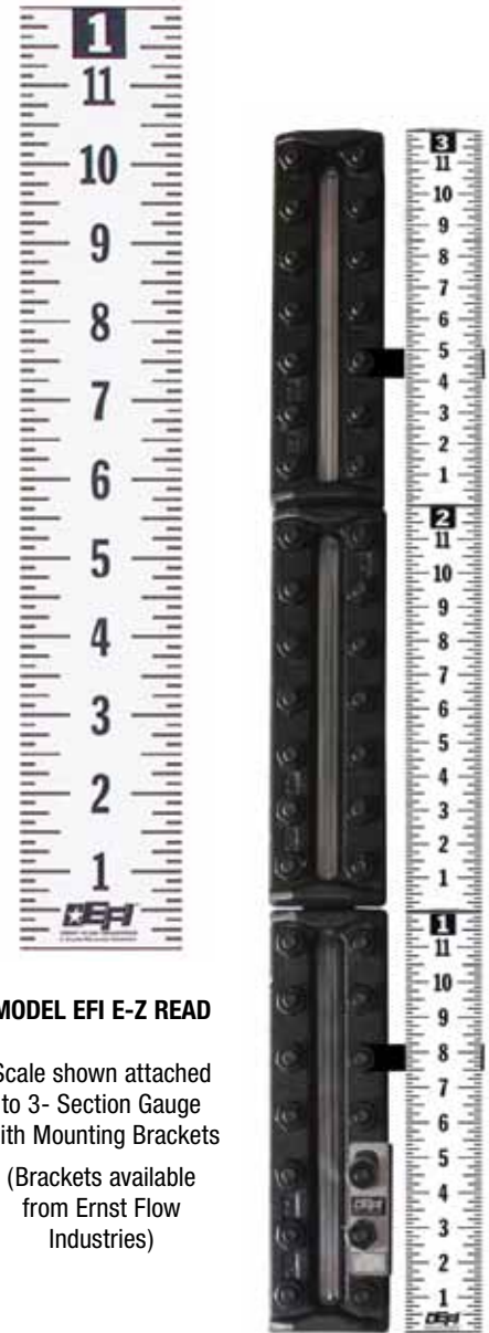
MODEL EFI E-Z READ

Scale shown attached to 3- Section Gauge with Mounting Brackets