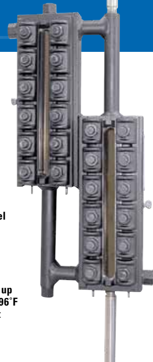
Chamber: Steel Cover: Steel

Special inserts up to *1500 PSI @ 596°F upon request