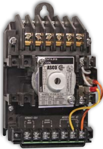
918 product shown with optional solid state control module