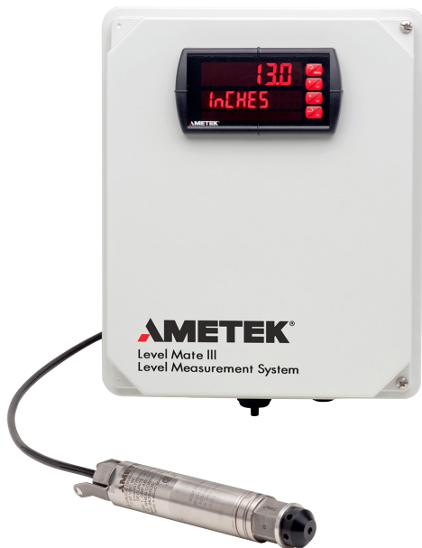
Level Mate III

The customized LEVEL MATE III meter provides excitation voltage to the sensor, displays data from the sensor and can transmit an optional analog output signal for remote monitoring or recording. The system is easy to calibrate from front panel buttons or from a PC with Meter View software option. The large, easy to read dual line LED display provides local indication while the optional isolated analog output can interface with ancillary display, recording or control devices. 2 or 4 standard relay options allow for set and reset programming. With standard desiccant and optional onboard surge protectors the LEVEL MATE III Level System provides you with the most versatile level measurement system on the market. Factory programming allows for quick installation and field labor time savings.