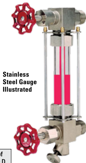
Stainless Steel Gauge Illustrated

Note: Center Supports also available for 1" O.D. gauge. Consult with Ernst Flow Industries.