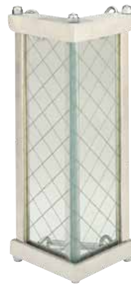
WIRE GLASS MODEL EFI 9-508