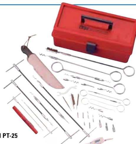
MODEL EFI PT-25

A complete line of tools designed to handle your packing maintenance with ease. The unique interchangeability of tips with flex or rigid holders allows a versatility not available elsewhere. Worn or damaged tips may be replaced at minimum cost rather than sacrificing the entire tool.