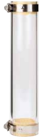
ACRYLIC MODEL EFI RCP