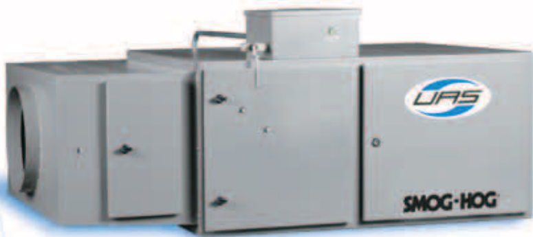
SHN-20 with optional inlet plenum

...equipped with airflow capacities ranging from 400 to 9,000 CFM.