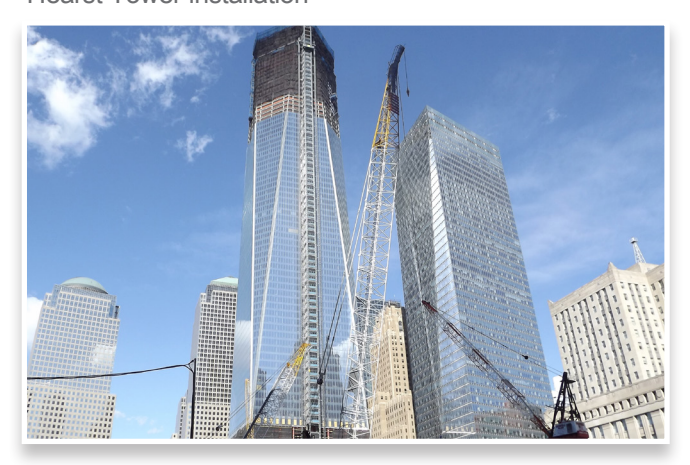
Freedom Tower installation