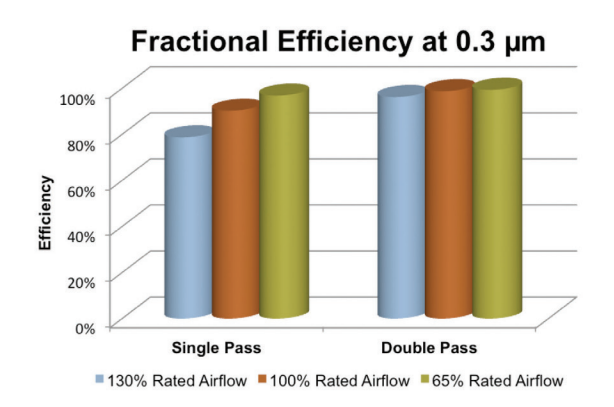
*95% efficiency has been independently verified in accordance with EN-1822-5 standards.