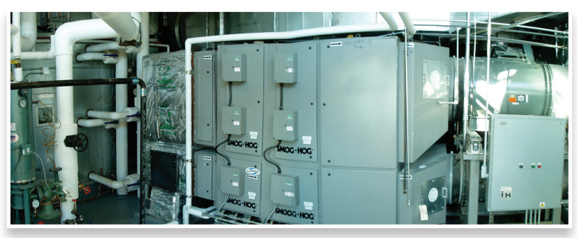
Hearst Tower installation