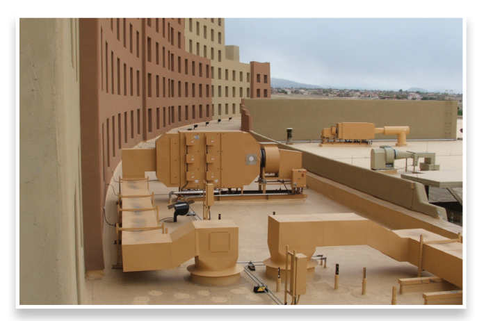
Sandia Resort & Casino installation