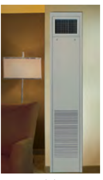
Slide MINIReStoraMoD™ into cavity, complete electrical and piping hookups, and start up.