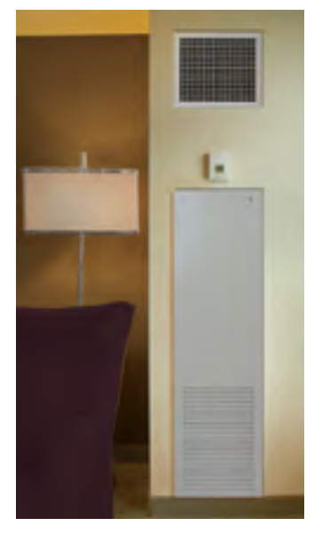
IEC or competitor's hi-rise ready for replacement.