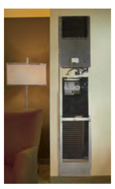
Remove surface components and trim drywall.