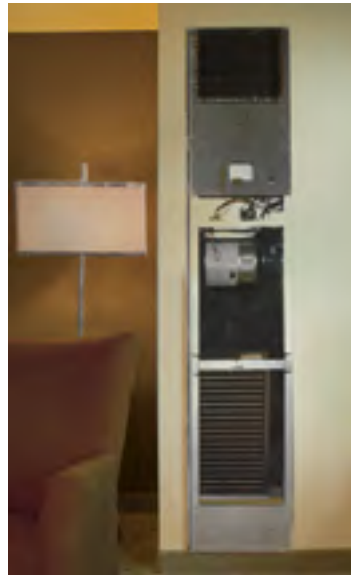
Remove surface components and trim drywall.