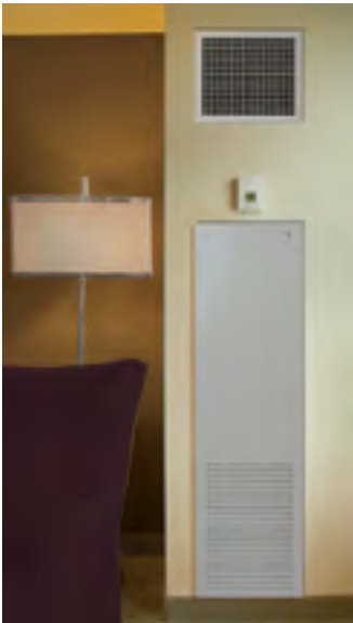
IEC or competitor's hi-rise ready for replacement.