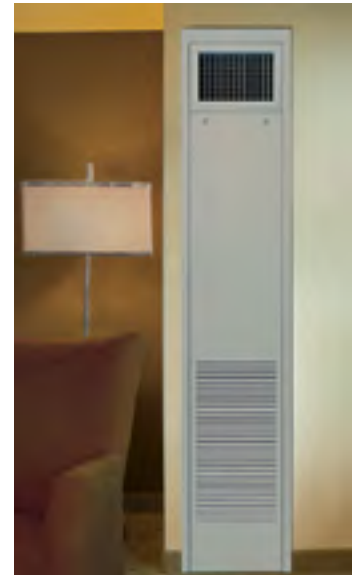
Slide MINI ReStora MOD™ into cavity, complete electrical and piping hookups, and start up.