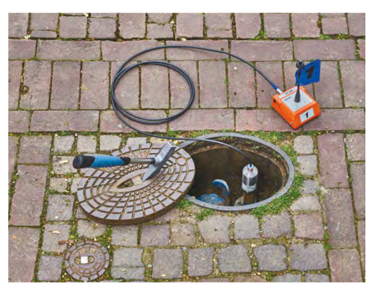
RT 200 radio transmitter with UM 200 microphone in use