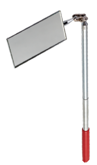
TLMIR3 Rectangular Telescoping Mirror 3-1/2" x 2"