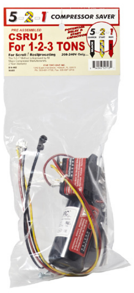
CSRU1 For 1 to 3 Ton units