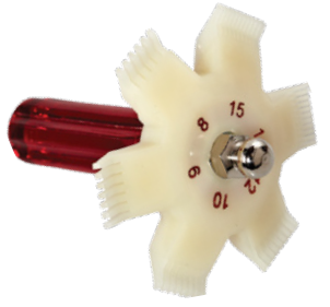
TLFC6 PRO-SET® UNIVERSAL 6-SIDED FIN COMB STRAIGHTENING TOOL Repair bent condenser fins