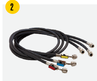
Premium 3-Pack 5' Hoses (Varies by kit. See chart below)