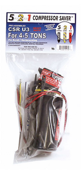
CSRU3 For 4 to 5 Ton units