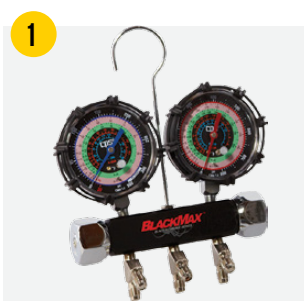
Two Valve Service Manifold (Varies by kit. See chart below)