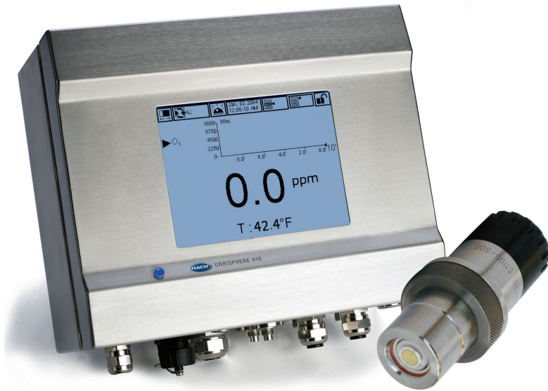
The Hach Orbisphere C1100 Ozone Sensor together with 410 Controller is the only inline sensor for ozone monitoring.