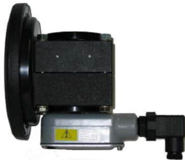
Shown w/Aluminum Body & (1) Reed Switch with Condulet enclosure and Plug-In Connector (Din 46350-PG 11)

CSA listed control switching is available in an explosion-proof enclosure which complies with NEC Class I, Groups C and D; Class II Groups E, F, and G; NEMA 7 and 9 standards. These are machined cast-aluminum enclosures with 1/2" FNPT conduit connection and 24" wire leads.