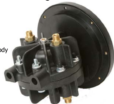
Shown with Engineered Plastic Body