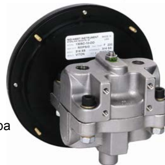
Shown with S.S. Cast Body