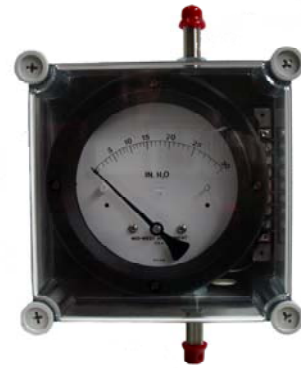
Shown in NEMA 4X Plastic enclosures

Factory preset switch at no extra charge (Specify Setting) Specify increasing or decreasing range to be set.