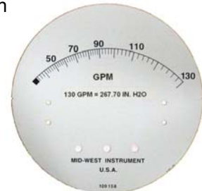
0-130 GPM Flow Gauge Scale

Common Applications: Tank Level Monitoring Horizontal or Vertical Flow, Liquid Level, Indication/Balancing, Filter Monitoring for Gases, Water Treatment Applications and Vacuum Application