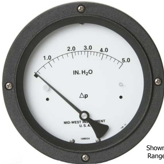
Shown here with Range 0-5" H 2 O

Model 130 is a rugged general purpose differential pressure gauge with a 4-1/2" round dial.