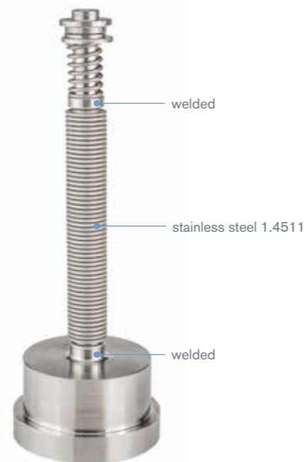
Metal bellows system