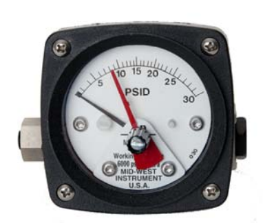
Model 120 0-30 PSID With Maximum Follower Pointer