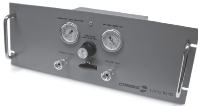
UVC1010, 19 inch wide rack-mount