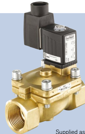
Supplied as shown

Servo-assisted brass plunger piloted solenoid valve with un-coupled rugged diaphragm. This valve is designed for neutral gases and liquids where a rugged and reliable solution is required.