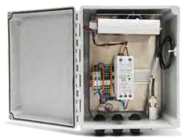
161954 Industrial Hot Spot