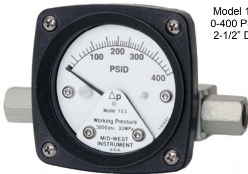
Model 123 0-400 PSID 2-1/2" Dial

A low cost differential pressure gauge for use in measuring the pressure drop across filters, strainers, separators, valves, pumps, chillers, etc., and for local flow indication and control.