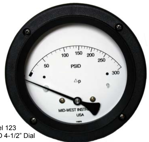
Model 123 0-300 PSID 4-1/2" Dial

An optional maximum indication follower pointer provides automatic indication of maximum differential occurring during a time period or system cycle. Reversed pressure ports are optionally available to facilitate installation and readability depending on which side of a filter, etc., the instrument must be installed.