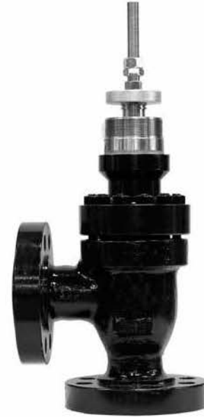
2" Mark DBAQ Series

Valve bodies are available in 2" size, with casted flanged connections, and ASME body ratings of Class 1500, or Class 2500.