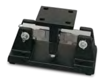
Cast iron module with RL75016 double-ended beam load cell.

The RL1600 Series mounting module kit utilizes several Rice Lake Weighing Systems components to provide an unmatched level of performance in tank and hopper weighing applications. The RL1600 Series kit is ideally suited for indoor and outdoor process control operations in the medium- to high-capacity ranges. Each module incorporates self-checking capabilities for thermal expansion and contraction.