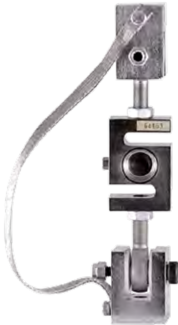
Module with RL20001 HE s-beam load cell.

The ITCM Series utilizes several Rice Lake Weighing Systems components to provide an unmatched level of performance in tank and hopper weighing applications and mechanical scale conversions. The ITCM HE incorporates clevis and unique rod-end ball joint assemblies to reduce the overall length to less than half of the traditional tension cell mounts, while providing correct load alignment. In addition, the load cell is completely electrically isolated from stray currents, which are a major cause of load cell failure. To complete the design, a grounding strap connects the two clevis assemblies to further provide safety to your load cells.