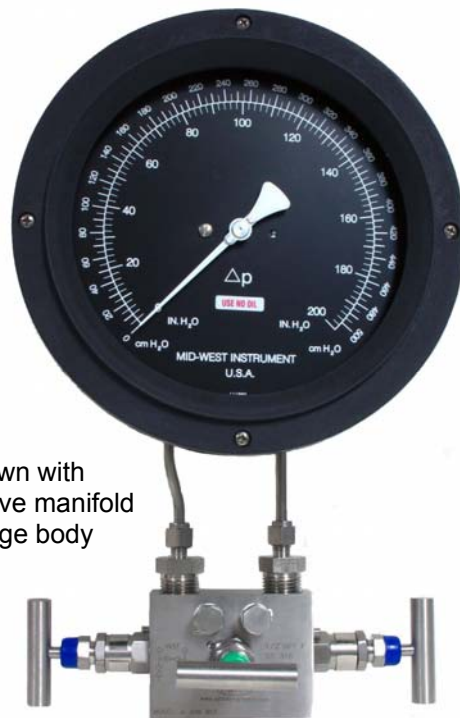
Model 116 shown with Optional S.S. 3-Valve manifold mounted to gauge body