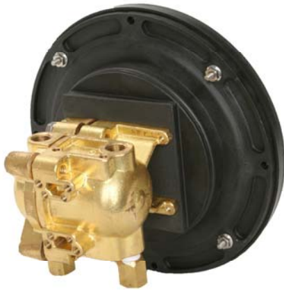
Model 116 Brass Cast Body

Model 116 can be equipped with one or two independently adjustable SPDT snap acting Micro-Switches which can be set on decreasing or on increasing pressure. A switch adjustment screw and a switch lock screw is accessible after removal of the lens and bezel (removal of 4 screws). Interface to the snap acting micro-switch is via color coded 18 AWG flying leads and a 1/2" FNPT conduit connection. Model 116 with switch temperature limits are rated at -20°C to +185°F