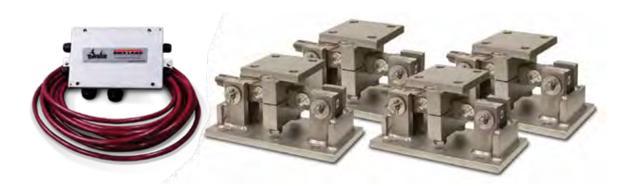
Available in configurations with three or four mounting assemblies. Picture is a representation of actual product

The RL1600 HE mounting module kit utilizes several Rice Lake Weighing Systems components to provide an unmatched level of performance in tank and hopper weighing applications. The RL1600 HE kit is ideally suited for indoor and outdoor process control operations in the medium-capacity ranges. Each module incorporates self-checking capabilities for thermal expansion and contraction.