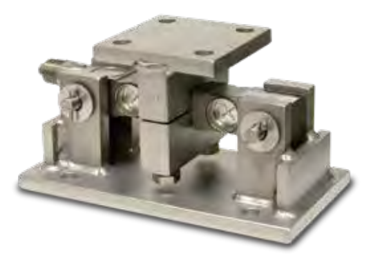
Fabricated stainless steel module with RL75016WHE double-ended beam load cell.

The RL1600 HE mounting module kit utilizes several Rice Lake Weighing Systems components to provide an unmatched level of performance in tank and hopper weighing applications. The RL1600 HE kit is ideally suited for indoor and outdoor process control operations in the medium-capacity ranges. Each module incorporates self-checking capabilities for thermal expansion and contraction.