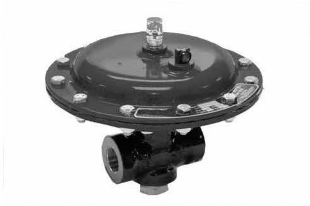
Mark 128PQC Control Valve

Any process leakage passing through the packing is permitted to escape through a leakoff vent which passes through the packing box and out the valve body. This prevents any leakage from passing along the stem into the actuator and also prevents loading pressure leakage from the lower diaphragm from reaching the valve body through the stem.