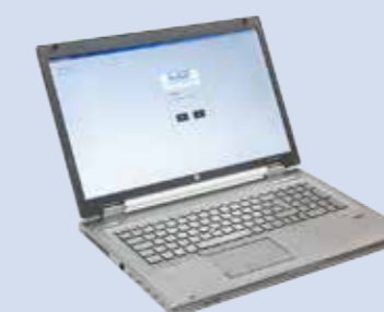
Parametrization/configu- ration and maintenance function via USB-interface