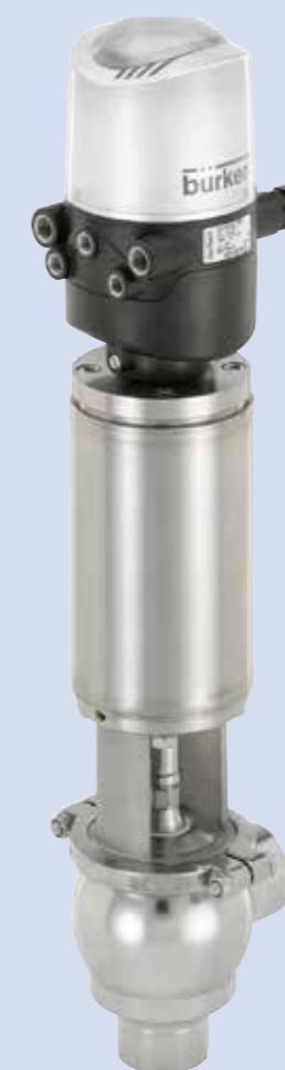
Hygienic Process valves decentrally automated