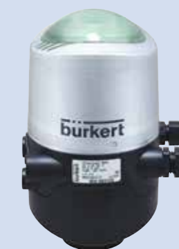
Control Head 8681 with coloured status indication