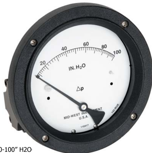
Model 142 0-100" H 2 O with 4-1/2" Dial