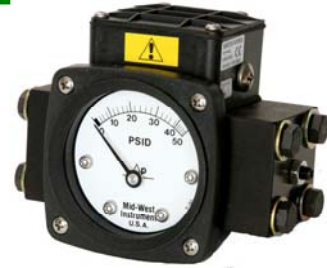
Model 142 shown with “BA” switch option

(2) Reed switches located inside NEMA 4x enclosure with 7 position terminal strip. An opening at rear of enclosure accepts ½” flexible weather-proof or conduit connector (supplied by customer).