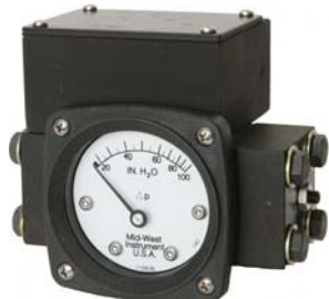
Model 140 shown with “EA” switch option.

(1) Reed switch in general purpose enclosure Division 2 Hazardous locations with 7 position terminal strip. An opening at rear of enclosure accepts ½” flexible weather-proof or conduit connector (supplied by customer).