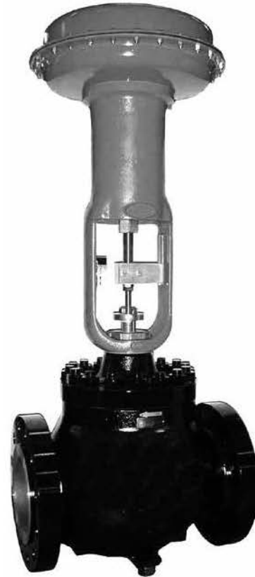
Mark ED/ET Series 8" Control Valve