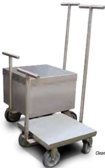
Clean Room, Calibrated Weigh Cart