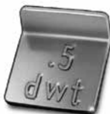
Leaf PN 12693