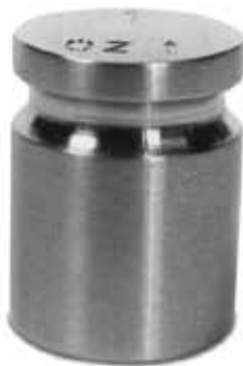
Troy PN 12711