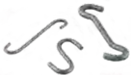
Hook (only) Weight (5 g - 1 g) and (1/4-1/32 oz)