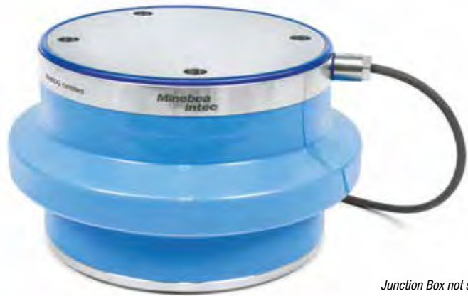
Junction Box not shown

A PR6241 S-type load cell is used with this module. This series is distinguished by its unmatched reliability, robustness and stability, enabling years of undisturbed usage without any readjustment, in addition to the high measuring accuracy and reproducibility.