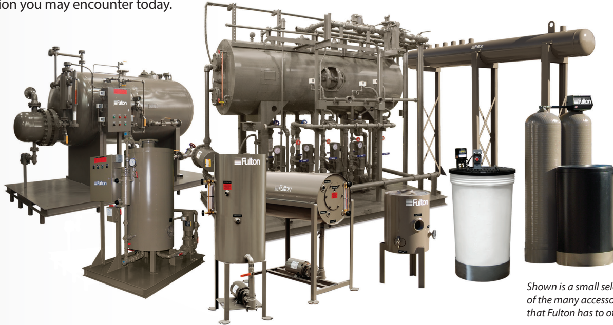
Shown is a small selection of the many accessories that Fulton has to offer.

A steam boiler is just one part of a well-designed steam system. Proper delivery of feedwater and collection of condensate are essential to the operation of a steam system. Fulton is able to manufacture standard or custom vessels to perform these tasks to ASME code or non-code, depending on the requirements in your area or system. Our auxiliary equipment is used to control the quality, pressure, storage capacity and enthalpy (heat content or temperature) of steam. The quality of the water used in a steam boiler will affect its life. Water treatment equipment will help provide quality feedwater so that corrosion and deposition in the boiler will be minimized. Fulton engineers can match equipment to just about any application you may encounter today.